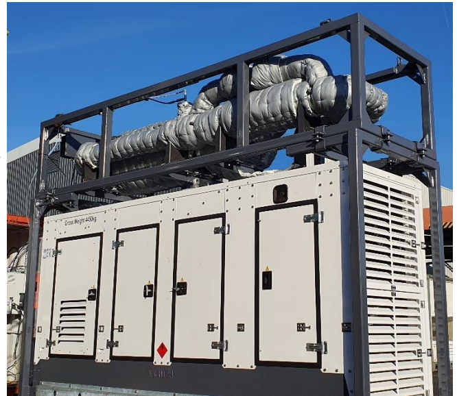
photo: 125 kVA genset met Discom Stage 5 frame

When your client is in need of a Stage V set (or Any other emission demand), you can simply place the frame over your canopy or on top of your container. We will take care of the proper working and within short notice you can deliver a silent and clean set to your client!